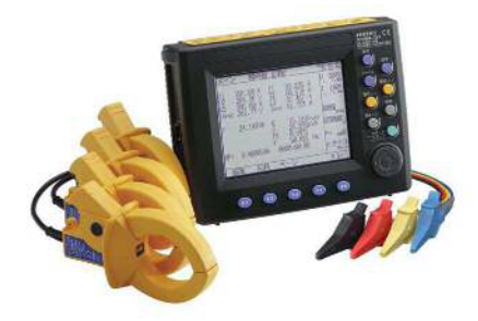
CLAMP-ON POWER HITESTER 3169 CLAMP-ON SENSOR 9661

After measurement and remedial measures, peak power was reduced by about 1 kW, and we can observe that power during lunch break dropped significantly. The effectiveness of power conservation efforts is evident.