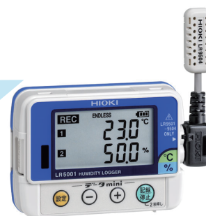
HUMIDITY LOGGER LR5001